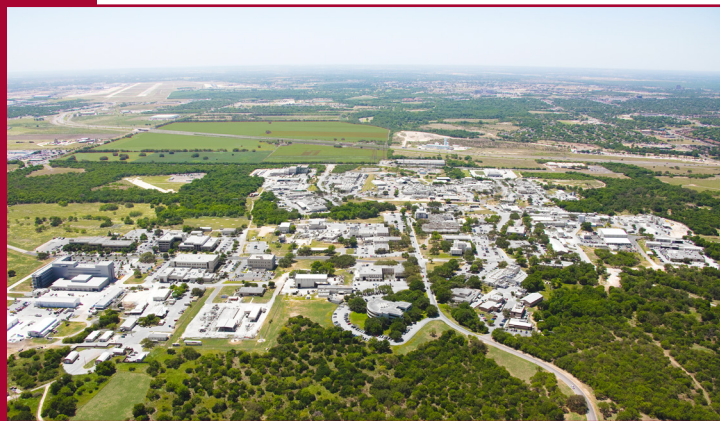
Southwest Research Institute is an independent, nonprofit, applied engineering and physical sciences research and development organization using multidisciplinary approaches to problem solving. The Institute occupies 1,200 acres in San Antonio, Texas, and provides more than 2 million square feet of laboratories, test facilities, workshops and offices for more than 3,200 employees who perform contract work for industry and government clients.

We welcome your inquiries. For additional information, please contact: