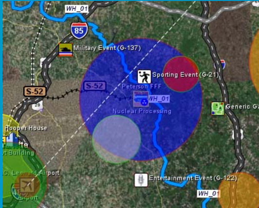
Section of the Hydra Map Window showing standardized intelligence data (colored circles), static operational data (facility location, roads, railways, and waterways), and several hypothetical dynamic events.

Project Number: 20.R9723 Sponsor: SwRI® Advisory Committee for Research Principal Investigators: Olufemi O. Osidele Thomas G. Glass Inclusive Dates: 7/2007 to 7/2008