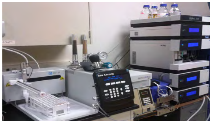
The HPLC (high-performance liquid chromatography) system is equipped with three detectors: variable wavelength (VW) UV-vis, corona-charged aerosol detector (CAD), and refractive index (RI).