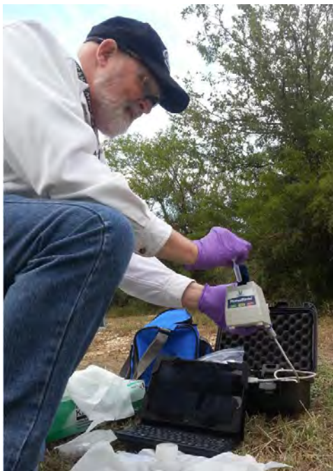
SwRI scientists conduct microbial field assays.

SwRI set up a gas chromatographic system to support a 24/7 pilot demonstration unit. The specialized system contains heated valve enclosures (top) in which remote-controlled valves deliver a target sample stream to a specific GC instrument.