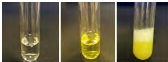
Accelerated shelf-life study of bio-derived oil determines product stability (left to right: t=0, t=24, t=44 hours).

Southwest Research Institute 6220 Culebra Road • PO Drawer 28510 San Antonio, Texas 78228-0510