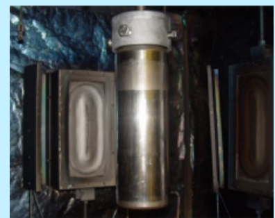
Top photo: PEMS deposition of 3D part