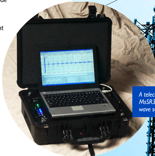
A telecommunication tower and MsSR3030R instrument used for guided wave screening of buried anchors.

Field evaluations have shown this method to be very effective in finding problem areas and in ranking the anchors based on criteria of good, medium, or bad. Typically, lower frequencies (20-70 kHz) are used to identify the presence of corrosion in a buried anchor section. A second probe can verify relevant indications.