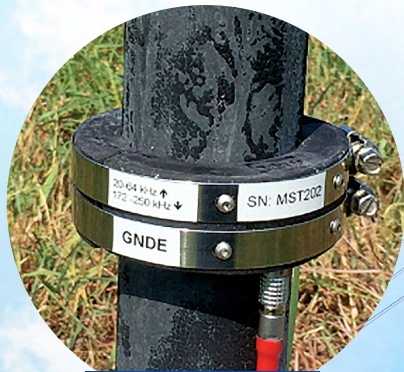
MsT probe for guided wave screening of buried rods.