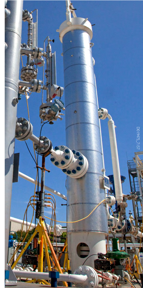
Gas-liquid separator performance evaluations at high pressure