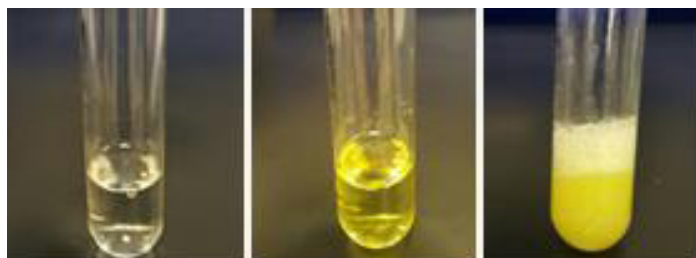
Accelerated shelf-life study of bio-derived oil determines product stability (left to right: t=0, t=24, t=44 hours).

Southwest Research Institute 6220 Culebra Road • PO Drawer 28510 San Antonio, Texas 78228-0510