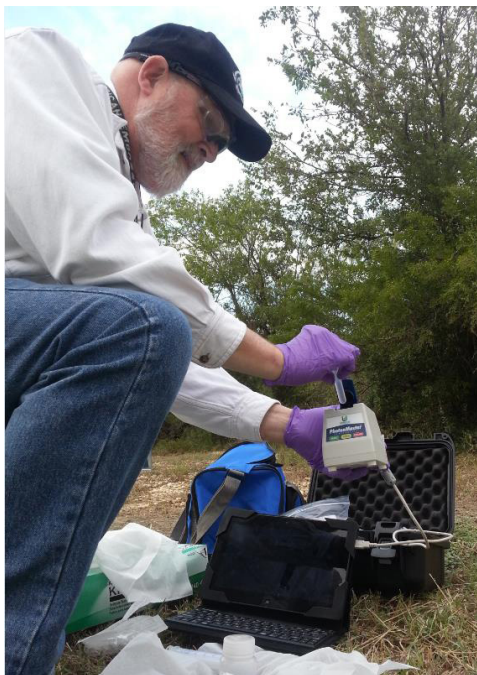
SwRI scientists conduct microbial field assays.

SwRI set up a gas chromatographic system to support a 24/7 pilot demonstration unit. The specialized system contains heated valve enclosures (top) in which remote-controlled valves deliver a target sample stream to a specific GC instrument.