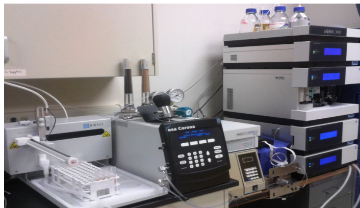
The HPLC (high-performance liquid chromatography) system is equipped with three detectors: variable wavelength (VW) UV-vis, corona-charged aerosol detector (CAD), and refractive index (RI).