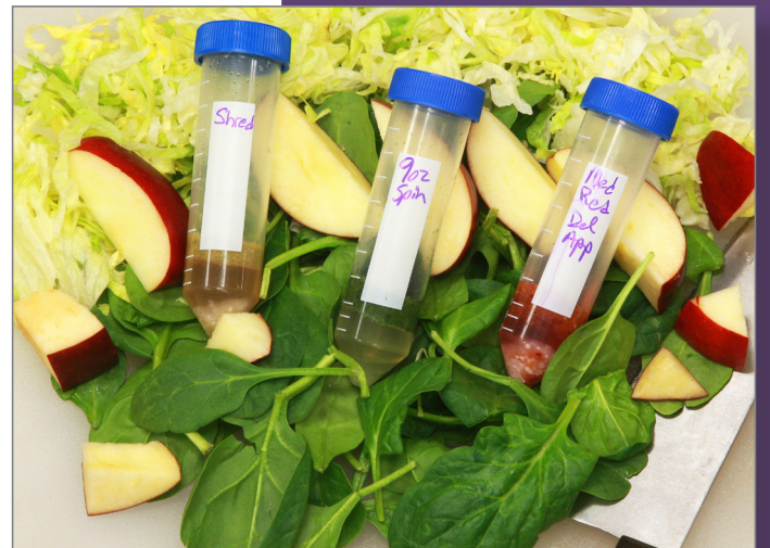
The SwRI food chemistry laboratory uses solid-phase extraction techniques that allow for sample extraction and interferent clean-up in fewer steps and with shorter turnaround times.