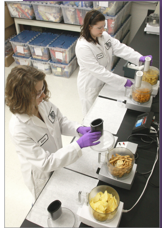
Chemical analysis of food samples begins with the use of household blenders to reduce foods to fine particles whose chemical components can be extracted for quick and consistent screening and analysis.