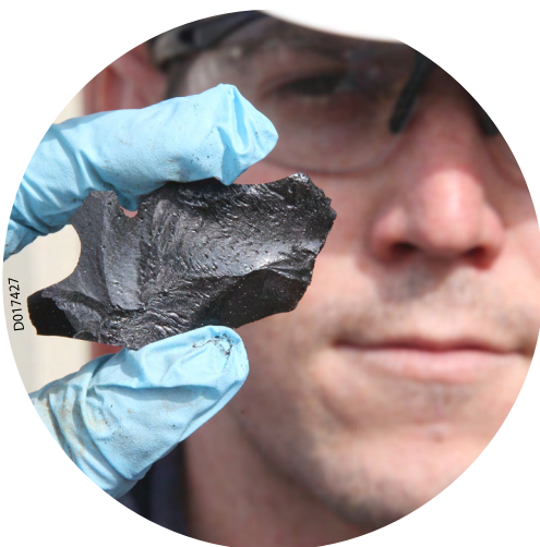
As the industry uses more unconventional petroleum reserves, refiners must develop new, economical ways to process heavy feedstock and residuum.

We welcome your inquiries. For more information, please contact: