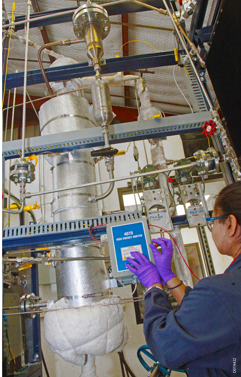
The lab-scale circulating fluidized bed system can be used for catalytic pyrolysis and feedstock evaluations.