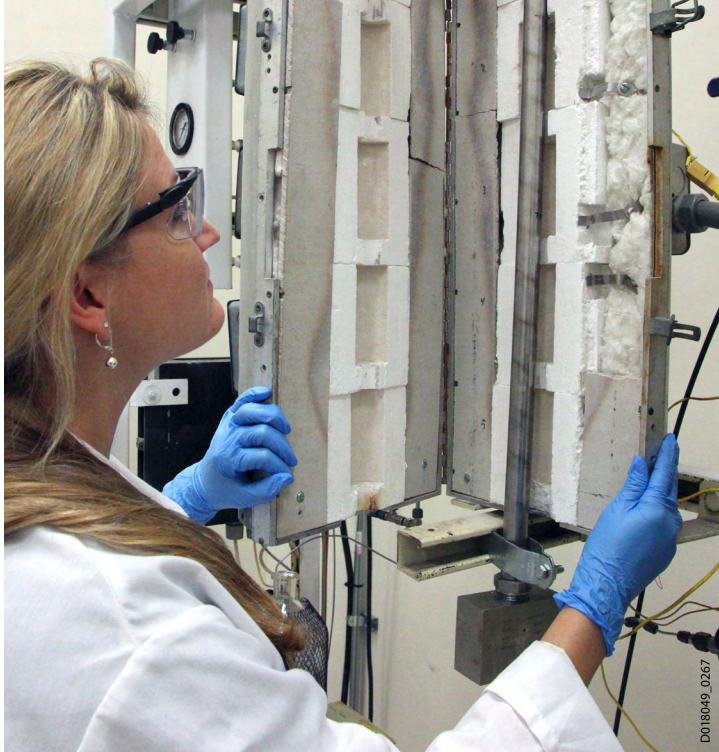
Unconventional feeds can be run through lab- and pilot-scale hydrocrackers/hydrotreaters to economically identify operating conditions and potential complexities prior to a production run.