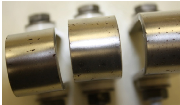
CNWRA measured corrosion rates of stainless steel used for spent fuel storage canisters to evaluate the potential effects of airborne salts.

Senior Program Manager Transportation, Storage, Disposal and Fuel Cycle Facilities 210.522.5582 dpickett@swri.org