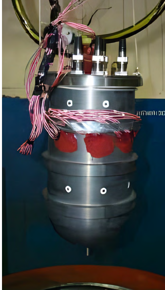
Instrument housing strain gaged prior to proof pressure test