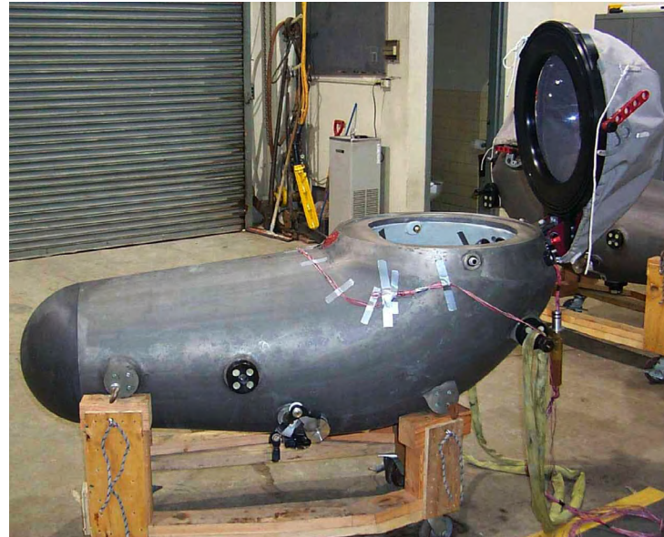
One-man submersible hull instrumented with strain gages for external pressure test to establish maximum depth capability